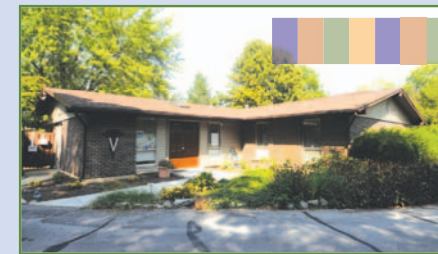
Clayton Animal Hospital