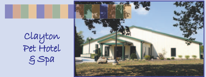
Clayton Pet Hotel & Spa