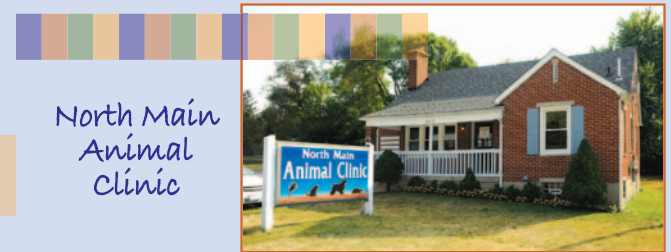
North Main Animal Clinic